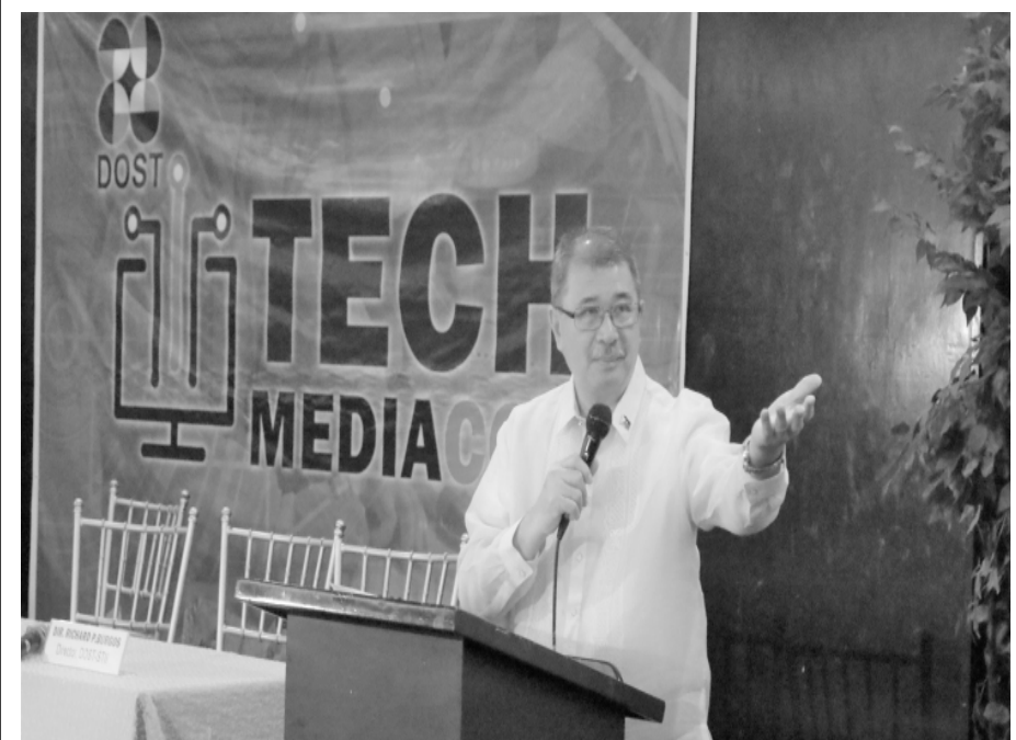
Department of Science and Technology secretary Fortunato T. Dela Peña announces future-proof initiatives through research and development programs and private sector collaboration.